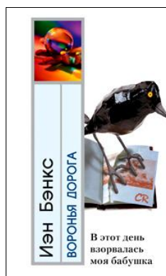
The Crow Road

Dead Air and Raw Spirit . How will the latter go down in the land of vodka?