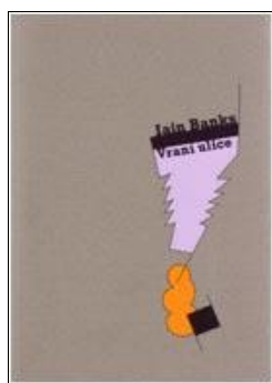
The Crow Road